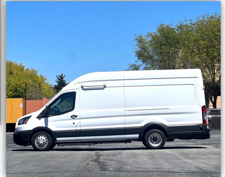
Category 2 (Armored Van)