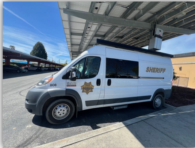
Category 5 (Mobile IC)