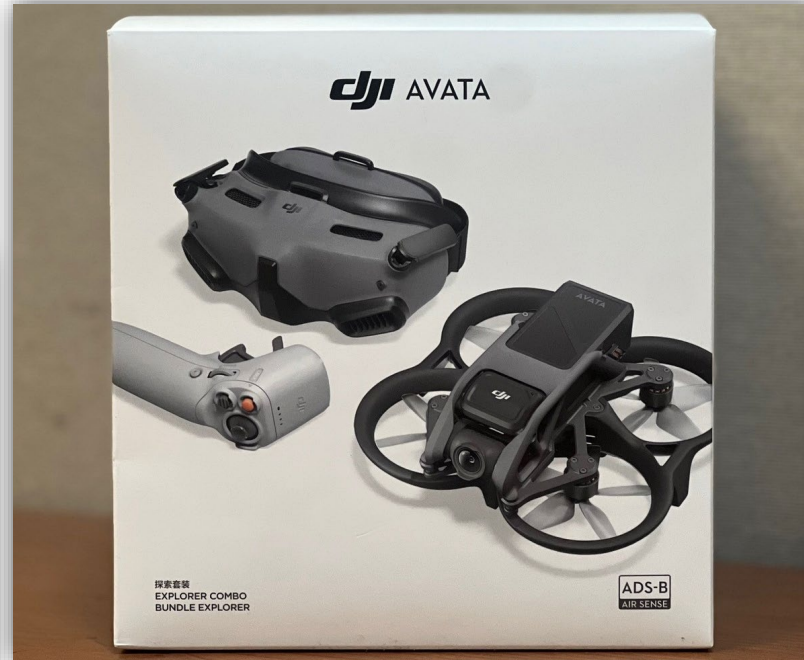
Category 1 (UAS)