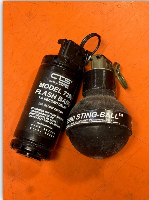
Category 12 (Flashbang/Stingball)