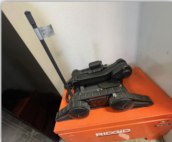
Category 1 (Robot)