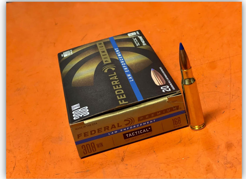
Category 9 (.308 Ammo)