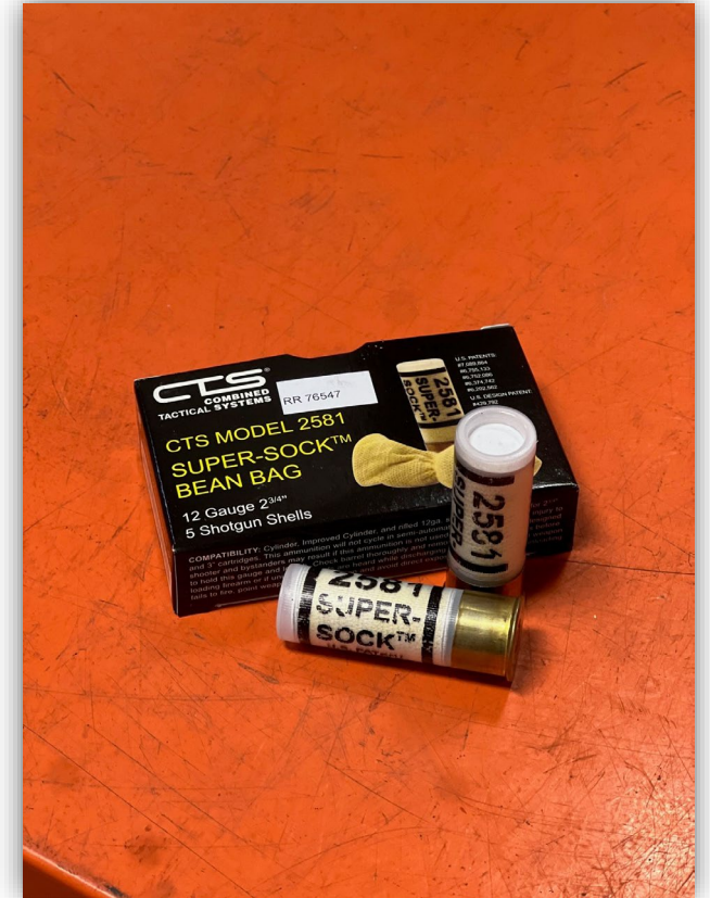
Category 14 (Beanbag Round)