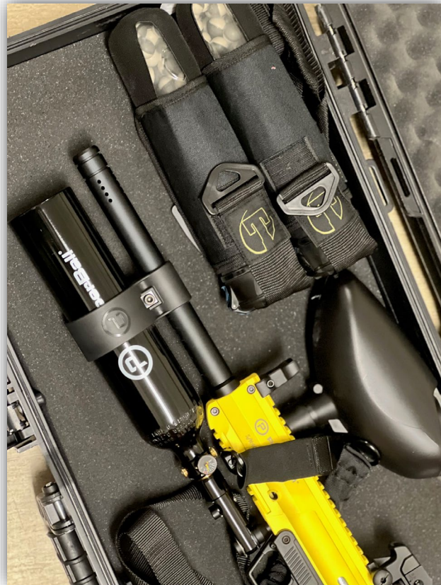
Category 12 (PepperBall)