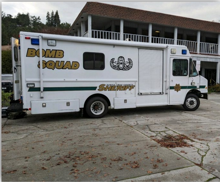
Category 5 (BOMB IC)